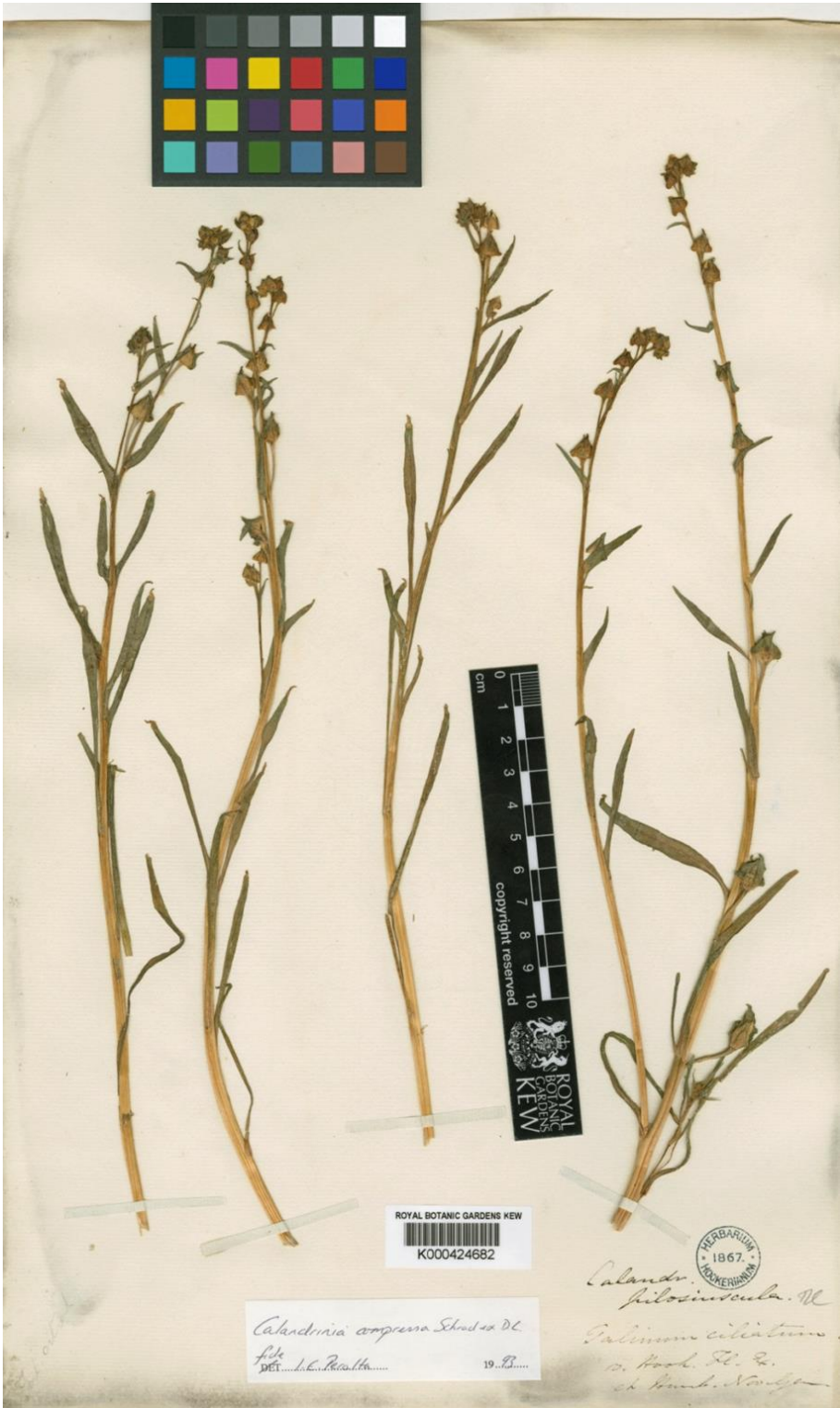
Fig. 2. Holotype of Calandrinia pilosiuscula DC. CULTIVATED: W. J. Hooker s. n., without date (K [K000424682 { http://specimens.kew.org/herbarium/K000424682 }] ).