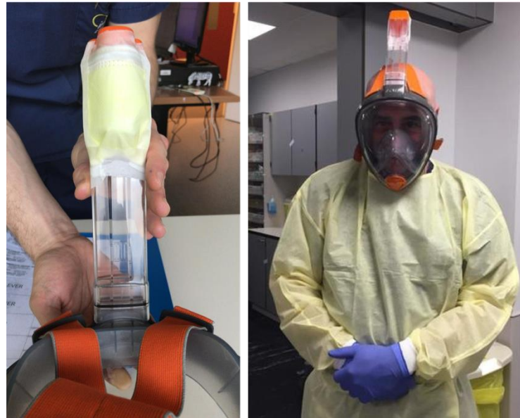
Figure 2. Snorkel mask 'makeshift' configuration with FFP2 cloth.