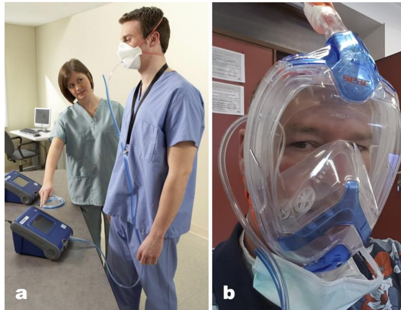
Figure 3. Particle count sampling setup. Fig 3a (from [12]) – general setup; Fig 3b – sampling tube fitted inside snorkel mask towards nose and mouth breathing chamber. Blue tubing – ambient air sampling line, transparent tubing – mask sampling line.

Fit testing using particles requires the filter to be maximally effective, so that the Fit Factor reflects the seal between mask and face. For filters that do not comply with the 99% filter efficiency (N99 or FFP3 standard), obviously, many particles would be counted inside the mask that have passed through the filter. In order to eliminate this bias, the PortaCount Pro+ 8038 can be instructed to use a 'N95 Companion Protocol', whereby only a subset of particle sizes (negatively charged particles of 40 to 70 nanometers) are counted. Before particle counting, sampled air is passed through a filter which blocks all particles except those in the 40 to 70 nanometer size range. As this is the particle size which is most efficiently filtered out by N95/FFP2 class filters, any particles detected using this protocol are considered to have passed through the face seal, not the filter (see Figure 4). The choice of acceptable Fit Factor may vary, however, for half-masks a minimal Fit Factor of 100 is considered (meaning that only 1% of particles in outside air is present inside the breathing mask) [14]. Using the N95 protocol, the maximum Fit Factor calculable is 200.