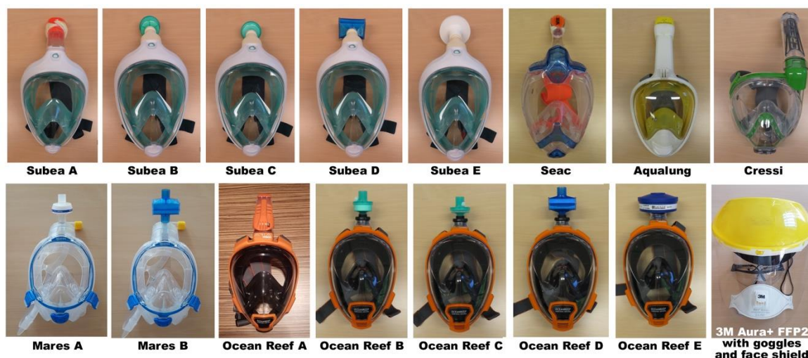
Figure 1. Snorkel mask configurations tested. See Table 1 for details. Lower right: ‘full face’ assembly with FFP2 mask (3M Aura 9322+), protection goggles and face shield, for size comparison.

A number of configurations were thus obtained, and evaluated according to: protection level, respiratory safety, and practical use (Figure 1, Table 1, and Figure 2).