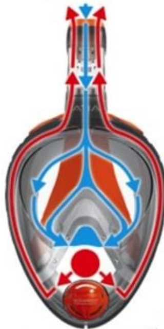
Figure 5. Schematics of air flow in snorkel masks. Blue – inspiration flow, red – expiratory flow.

Respiratory safety was evaluated by measuring simultaneously the end-tidal carbon dioxide (ETCO 2 ) levels sampled by a fine collecting tube passed between mask skirt and cheek into the breathing chamber of the mask. This was found not to result in significant leakage. All masks are fitted with a silicone separation with two one-way valves between the nose and the eyes, creating a small oro-nasal internal mask (breathing chamber). Inspired air flows from the inspiratory snorkel channel (situated above the eyes, usually centered on the forehead) toward the breathing chamber (nose and mouth, through the two valves), while during expiration, air flows through dedicated expiration channels laterally toward the snorkel, or through a central ventral valve directly outward (Figure 5). This construction is intended to minimize respiratory 'dead space' while at the same time reducing fogging-up of the viewing chamber. The ETCO 2 level was measured continuously using side-stream measurement, using the medical monitoring system of the hyperbaric chamber at the Military Hospital, Brussels, in atmospheric (1 ATA) conditions (doors open).