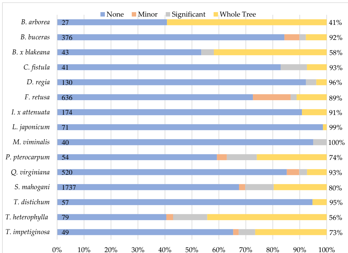
Figure 2. Proportion of each damage type (described in the text) for each species. Numbers at the left edge of each bar indicate the sample size excluding individuals not found in post-hurricane assessments; numbers at the right edge of the chart indicate survivorship, computed as the proportion of trees of each species rated as having no damage, minor damage, or significant damage after the hurricane. Complete binomials are in Table 1.

Species differences also existed with respect to the proportion of individuals in each damage category (Figure 2). For five species ( D. regia , I. x attenuata , L. japonicum , M. viminalis , T. distichum ), more than 90% of individuals sustained no damage. For an additional four species ( B. buceras , C. fistula , F. retusa , Q. virginiana ), more than 80% of individuals sustained no or minor damage. The remaining six species fared worse. For B. arborea and T. heterophylla , more than 50% of individuals sustained significant damage or whole tree failure; for the remaining four species ( B. blakeana , Peltophorum pterocarpum (DC.) Backer ex K.Heyne, S. mahogany , Tabebuia impetiginosa (Mart. ex DC.) Standl.), at least 30% of individuals sustained significant damage or whole tree failure.