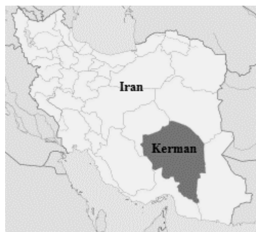
Fig. 1. Study area: Kerman, Iran

The current study focused on the farms located near the city of "Kerman" in Iran. Kerman is the largest province in Iran (area of 183,285 km 2 ), that embraces 11% of the land area of Iran (see Fig. 1). To meet the objective of the study, two types of data were collected: 1) agricultural production and 2) weather information. Spriter-GIS system used for the collection of data such as crop species, irrigation, and crop yield.