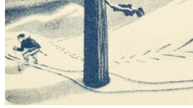
Fig. 1 From Charles Addams, The New Yorker, 1940

The arrangements of this paper are: Sect. two gives studies on the crisis of single particle's simultaneously passing through Young's Double Slits; Sect. three investigates plane wave's simultaneously passing through both Young's Double Slits and any many slits; Sect. four shows quantum uncertain principle's making the single particle with global property have no certain path, and then makes the single particle wave simultaneously do pass the double slits., Sect. five gives a general theory of interference pattern appearance from a kind of quantum probabilistic entanglement; Sect. six shows discussions, summary and conclusions.