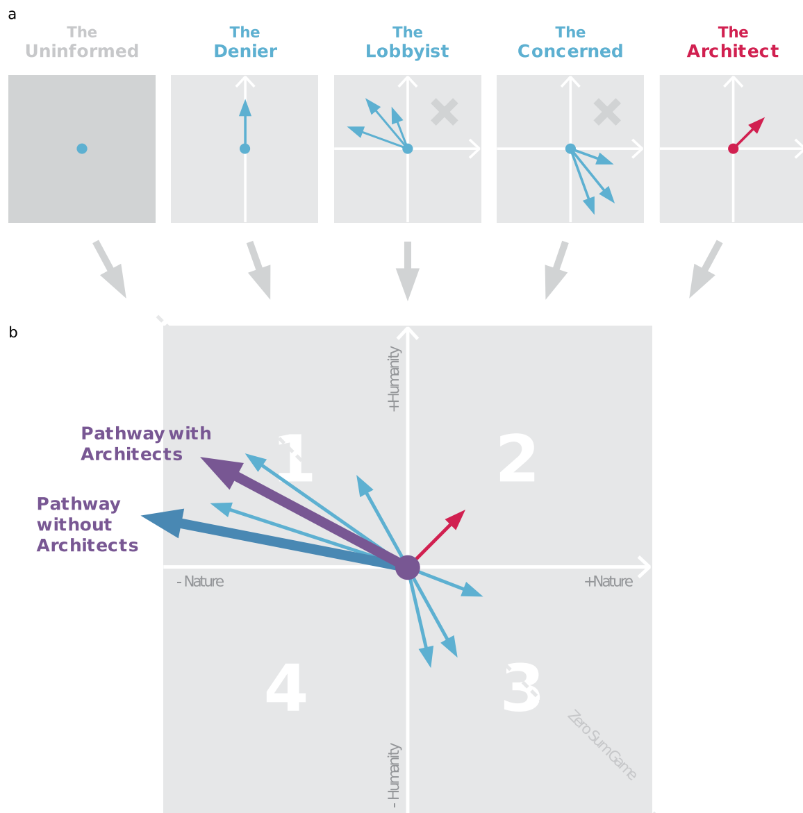
Fig. 2. The solution space (a) is another heuristic to represent the development pathways each archetype is ready and willing to explore. Without awareness, there is no mental model of the problem and no solution space. If the causal links between human action and natural process are in doubt, the solution space is unidimensional. The other archetypes perceive and recognize the interactions between humanity and the natural system. This creates 4 sub-spaces: (1) Humans win at the expenses of Nature; (2) Win-win pathways; (3) Nature wins at the expenses of Humanity and (4) All loose. Values define the quadrants one is prepared to explore. An archetype is adverse to explore dark grey quadrants, favourable to light grey quadrants and does not consider crossed quadrants as possible. A decision is represented by a vector whose length relates to the power of that stakeholder (b) The pathway the system will follow results from the sum of all individual vectors. This represents the tug of war we want to break away. The Architect can help move the system towards new directions. The playing field however is not level. There are physical and natural constraints that we do not address here.