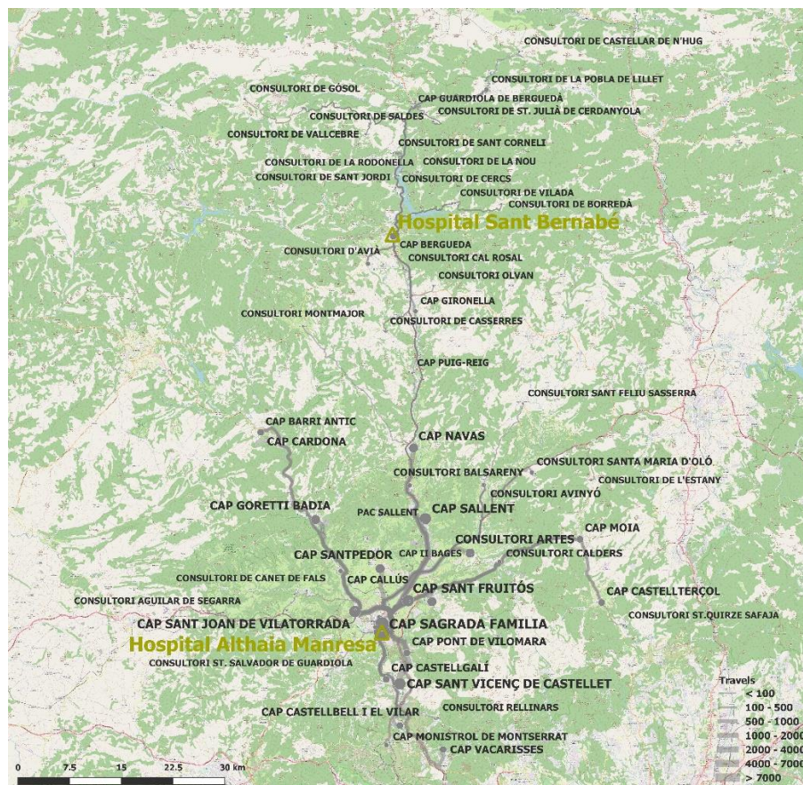
Figure 2: Origin and destination (either Hospital Sant Bernabé in Berga or Althaia Xarxa Assistencial Universitària in Manresa) of telemedicine visits avoided. The thickness of the line corresponds to the number of journeys saved.

Also, according to an aggregate analysis of the users' profile, it can be observed that the average age of a telemedicine service user is 52, with a standard deviation of 23, suggesting the heterogeneity of the beneficiary profile. If we assume that people aged over 65 (34% of the total sample) and under 16 (8%) require the company of a caregiver during their visits, this means that we have to add the indirect impact in terms of opportunity costs of the time spent by caregivers in 42% of the cases analysed.