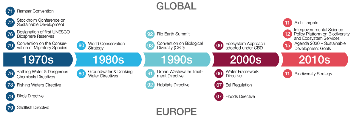
Fig. 3: Selected international conventions (above) and European policies (below) directly relevant to freshwater biodiversity conservation and restoration.

manage established species. The WFD itself and complementary policies illustrate the potential of a holistic approach to planning and updating policymaking for freshwater.