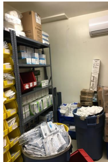
Figure S3. Before implementing the 5'S program in the TW.