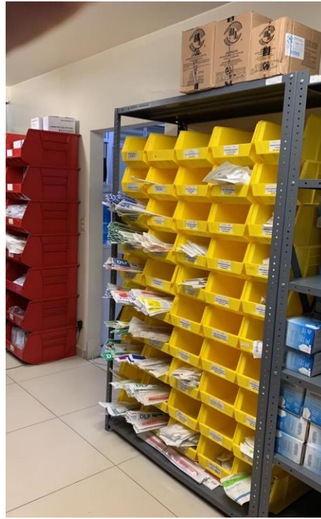
Figure S4. After implementing the 5'S program in the TW.