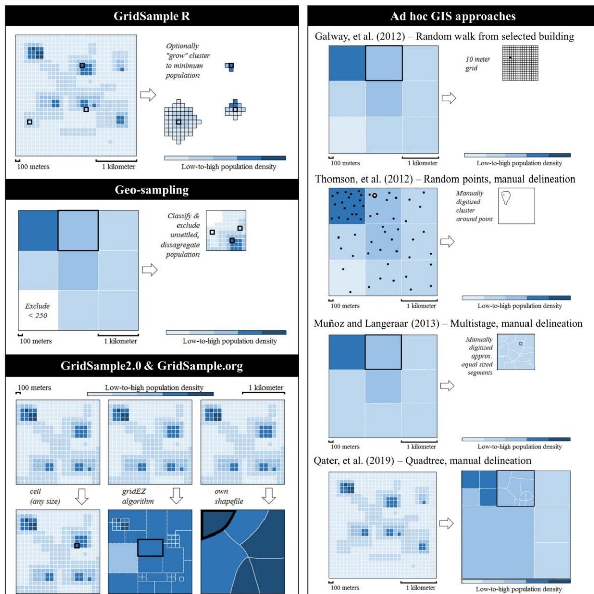
Figure 2. Visualisation of approaches to derive a gridded population sample frame