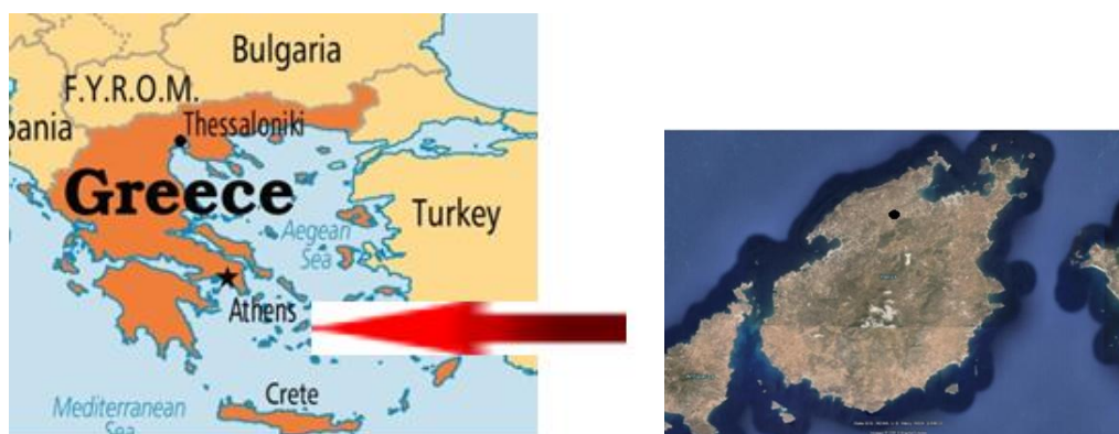
Figure 2. Paros island and selected (dot) region's location for M.C.W.H application

So, it was decided to select a region as a pilot one in order to prove that M.C.W.H. technique may resolve with low cost the irrigation problem of the island and save so invaluable underground water resources for other uses (i.e. drinking water after treatment). The region selected has an area of 7 ha (200x350 m). Its position (in the north of the island, near Longovardas monastery) is illustrated in Figure 2. It is ideal because all of the criteria for the installation of a M.C.W.H. system are fulfilled (Rands 1980). Namely: