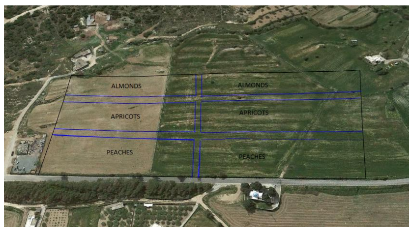
Figure 4. Region of application

A rural road network will be constructed in the total area of 7 ha and so, the net irrigated will be of 6.6 ha or 2.2 ha per arboriculture. Thus, 22000/17= 1294 almonds trees will be planted, also 22000/15=1467 peach trees and 1467 apricot trees (Fig.4).