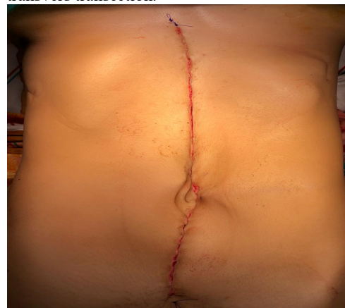
Fig-2: The abdomen was closed from craniocaudally with 1 no PDS. Skin was closed with 3/0 prolene suture.