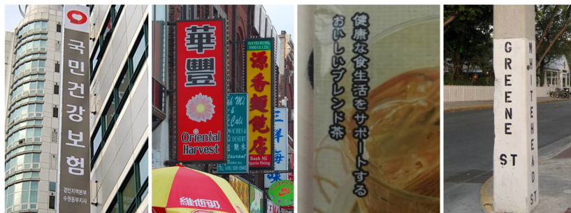
Fig. 1: Majority of the prior scene text recognition algorithms only attempted to cover the horizontal text. However, in several Asian countries, including China, large amounts of text in signs, books, and TV commercials are vertically directed.

of text in signs, books, and TV commercials are vertically oriented. Horizontal and vertical texts exhibit different characteristics that should be simultaneously solved for. They occupied different aspect ratio text region in image. Therefore, a clever algorithm must be developed to deal with both types of text. Fig.1 depicts the reason due to which the OCR algorithm is able to handle the vertically directed text in real environments. A recent study used arbitrarily oriented text recognition (AON)[1] encoded image input in four directions (top-to-bottom, bottom-to-top, left-to-right, and right-to-left) to detect a freely rotated word. AON can, therefore, adapt in an unsupervised manner to tackle the rotated text using four orientations of directional information.