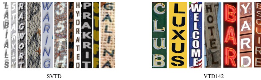
Fig. 3: SVTD is a new synthetic vertical text dataset in a similar fashion as [1]. VTD142 is real vertical text dataset, which was collected from web.

We can define x_t as the input of LSTM, as depicted bellow.