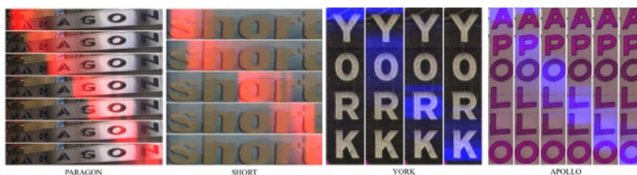
Fig. 5: Results of attention and recognition for horizontal and vertical characters.

The experiments were performed on a workstation with one Intel Xeon(R) E5-2650 2.20GHz CPU and one NVIDIA Tesla M40 GPU.