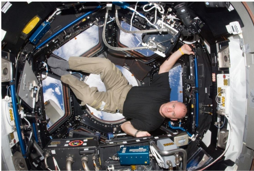
Figure 1. NASA astronaut Scott Kelly, Expedition 25 flight engineer, is pictured in the Cupola of the International Space Station on Oct. 14, 2010.

we will have to accommodate a possible planetary settlement distant from the terrestrial one, will not only be a "home for the man", but they will represent those spaces in which perhaps the same astronauts should be treated as if they were their own health centers or hospitals.