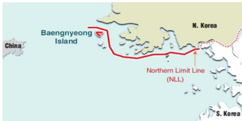
Figure 1. Location of Baekryeong Island (Baekryeong-do)