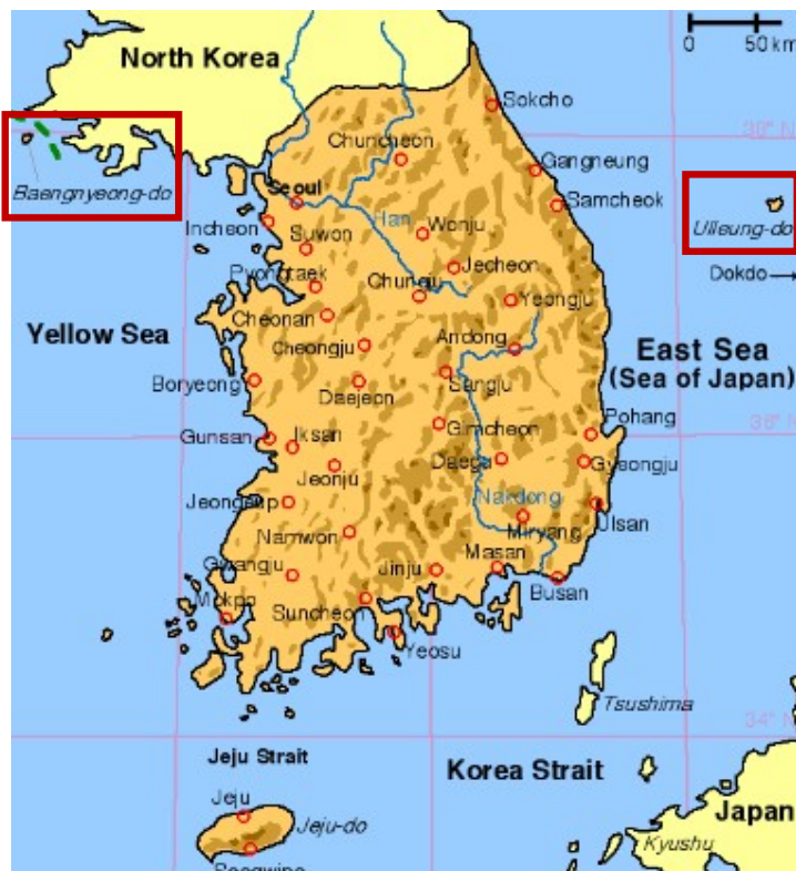
Figure A1. Location of Baekryeong-do and Ullreung-do [28]