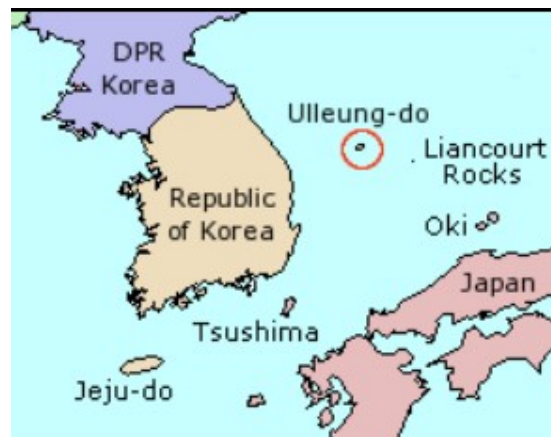
Figure 2. Location of Ullreung-do [28]

Ulreung Island (sometimes called Ulreung-do) is one of the islands in Republic of Korea. It is 120km (75 mi) east of Korean Peninsula. It is one of the forefront areas that border South Korea with North Korea. In addition, it is geographically distant from China, thus satisfying assumption 1 approximately. In Ulreung-do, there is Naval 118th Early Alert Squadron in the forefront. It is a guarding and book defending unit of the Navy 1 st Fleet. It is responsible for defense of Ulreung-do. It performs maritime surveillance mission of the whole East Sea. Ulleungdo has a lower population density and fewer vehicles compared to Seoul [28]. Therefore, main factors affecting the fine dust index in this region are expected to be the factors such as the elements of the forefront military bases or North Korea due to the characteristics of the forefront. Ulreung-do is a typical example of a remote island. Its environment of which is very similar to that of Baekryeongdo.