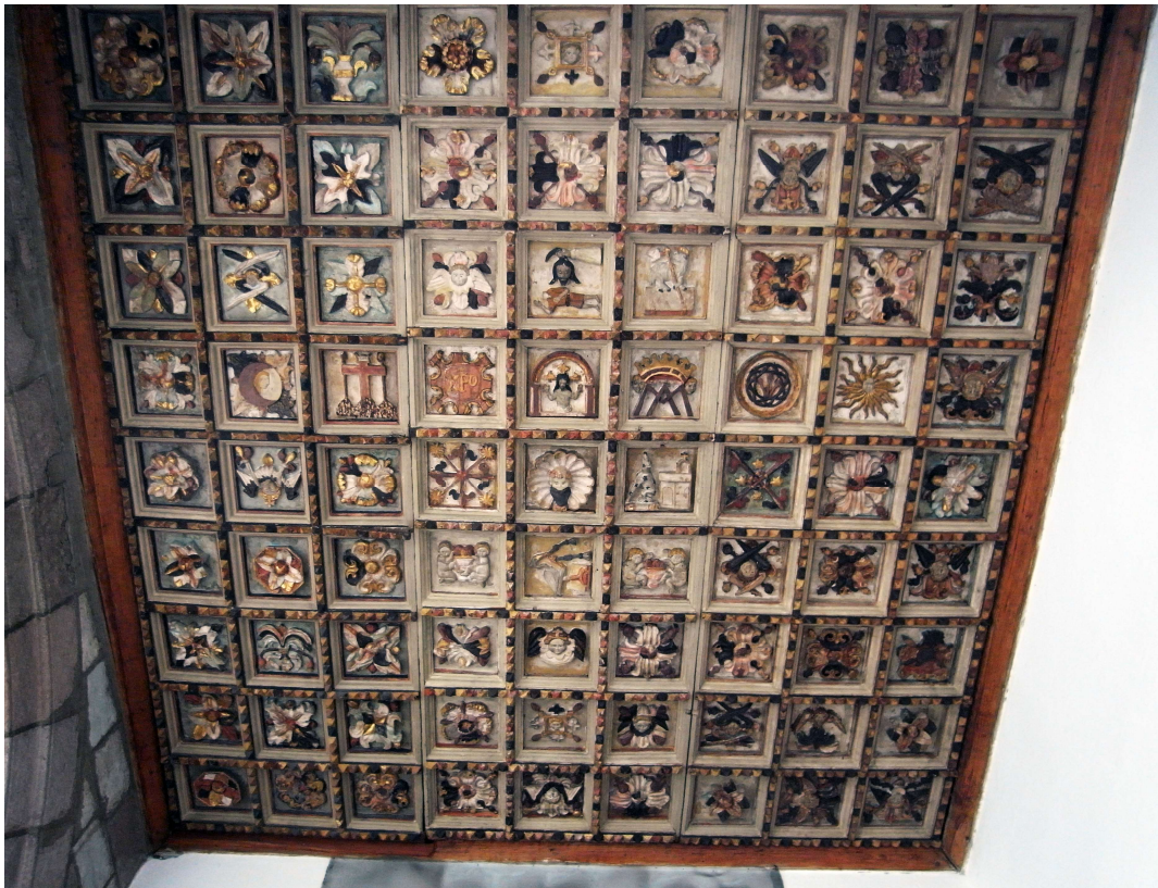
Fig 3. Cloister chapel's ceiling of San Juan Bautista de Coyoacán convent. Mexico City.

was possible since Renaissance coffered ceilings were employed, a perfect examples of this technique are the convents of San Juan Bautista of Coyoacán (Mexico City), Santos Apóstoles Felipe y Santiago of Azcapotzalco (Mexico City ) or the convent galleries of Tzintzuntzan.