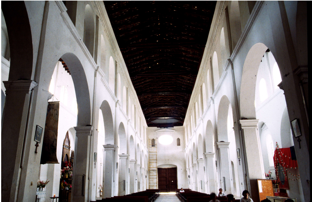
Fig5. Interior of Santo Domingo church. Chiapa del Corzo

The builders usually opted to reserve the wooden structures for the naves, being the central nave wider and separated from the aisles by arches, either separating the presbytery with barrel vaults, for instance the convent of Tecali (State of Puebla), or using different vaults, for example the crossing of the Santo Domingo in Chiapa del Corzo (State of Chiapas). The latter have a more complex design since the nave and the aisles are separated by two rows of arches over the pillars.