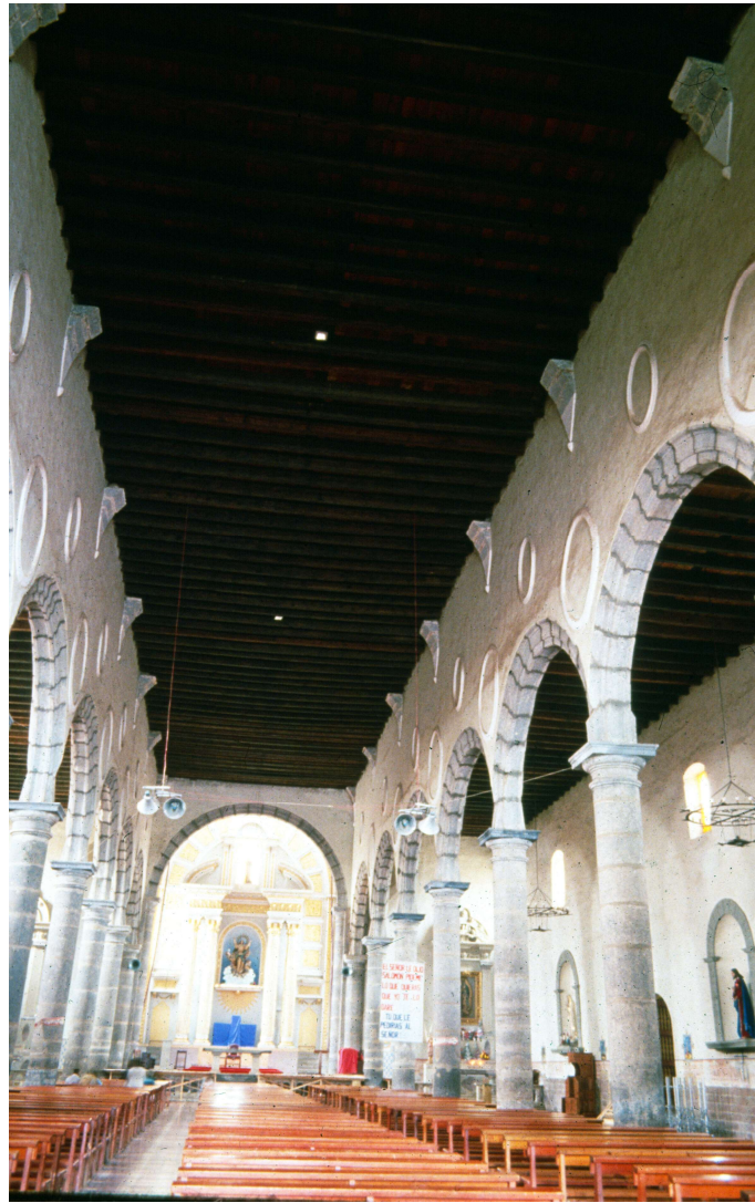
Fig6. Interior of San Pedro and San Pablo church. Zacatlán de las Manzanas

The church of the Dominican convent of Santiago Apóstol de Cuilapan (State of Oaxaca) is one of the buildings that has generated more debate since its original function is not known. Whether it was an isolated open chapel to which three naves were added, therefore conserving with these lateral entrances its open nature, or it was basilica with a differentiated chevet, there are still unsolved issues (Artigas 1983). We consider an interesting subject of study how carpentry would play a decisive role in the spatial definition of these splendid constructions.