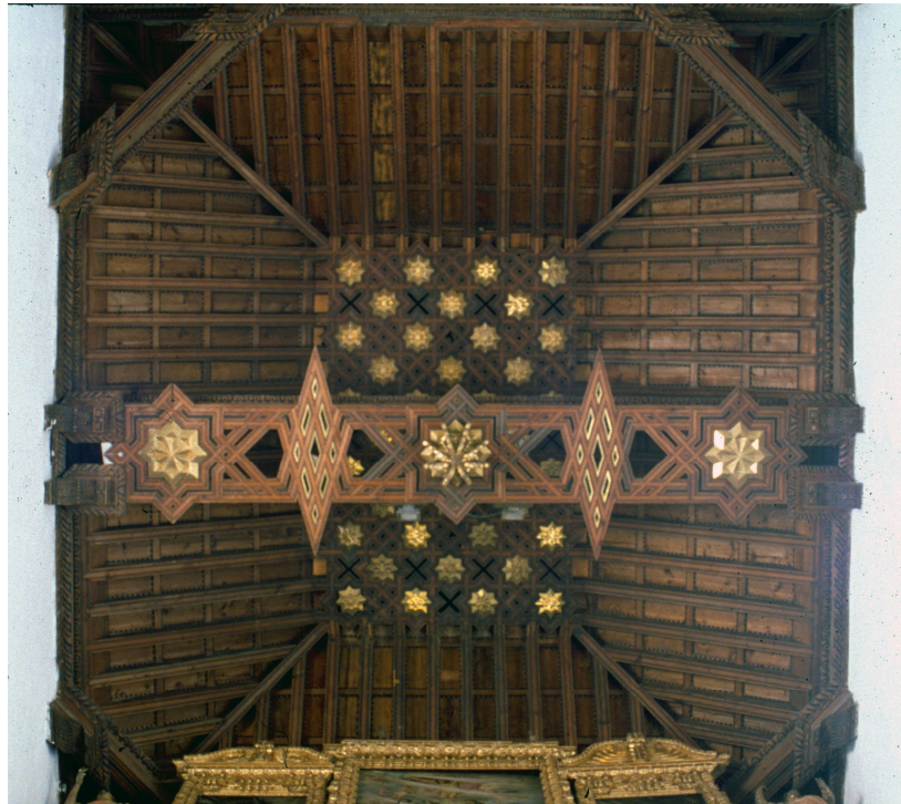
Fig1. Main chapel's ceiling of San Francisco church. Tlaxcala

The roofs structures respond to the typical Mudejar typologies, from the armadura de limas 5 to the alfarjes , the simplest and most common type. There are few remaining examples of the former, for instance San Francisco in Tlaxcala and San Diego in Huejotzingo (State of Puebla); however, the extensive documentation and various engravings, kept in different archives, bear testament of the complex architectural solutions that nowadays are not noticeable.