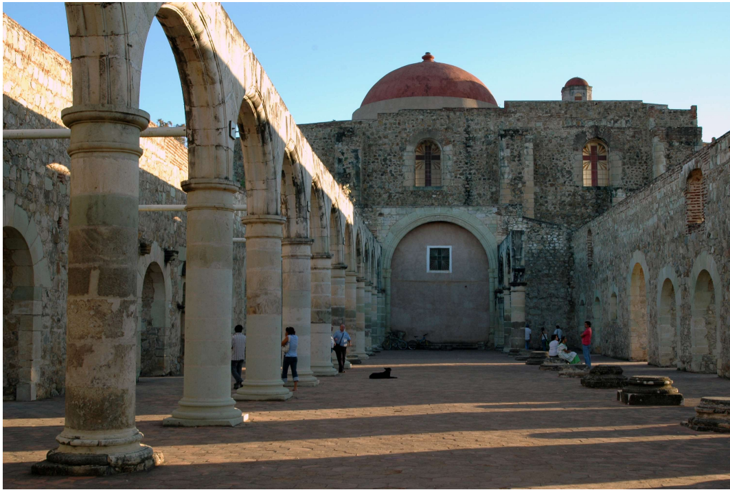
Fig7. Interior of Santiago Apostol church. Cuilapan

In a document dated in 1800, kept in Archivo General de la Nación de México, the master Juan Esteban Fernández reported a series of necessary repairs of a church as well as its description: "...dicha Yglesia es de 3 naves con sus pilastras de cantería, la maior es de tixera y las de los costados de viga tendida, tiene la mayor 13 caxas en toda su extensión, dos están nuevas, y las 11 restantes mui maltratadas que amenazan ruina por lo que es necesario hacerlas nuevas... La cubierta de los costados igualmente esta maltratada en la mayor parte y aunque no es necesario hacerla toda nueva se debe reparar todo lo maltratado porque asimismo amenaza total ruina..."(Espinosa 1999). This document confirms some of the theories proposed (Kubler 1982 and López 1992); it supports the idea of the use of the alfarjes during the 16 th century in significant projects; acknowledging this technique as suitable for the creation of ambitious spaces and not only as part of quickly-built constructions. As we have pointed out, nowadays this temple only maintains the perimeter elevations and some columns and arches but none of its roofs.