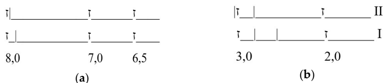
Figure 1. Investigation of the extraction process by the PMR method. (a) DMF; (b) saturated solution of CoCl_2 in DMF.

Investigation of the extraction process by the PMR method.