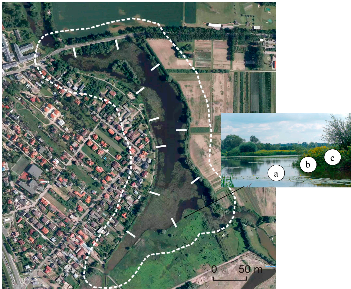
Figure. 2. Research area (dotted line) and vegetation sampling plots scheme within transects; white circles: a - aquatic vegetation, b - vegetation of the rushes, c - terrestrial vegetation of the shores. Signs based on Powsinkowskie Lake example.