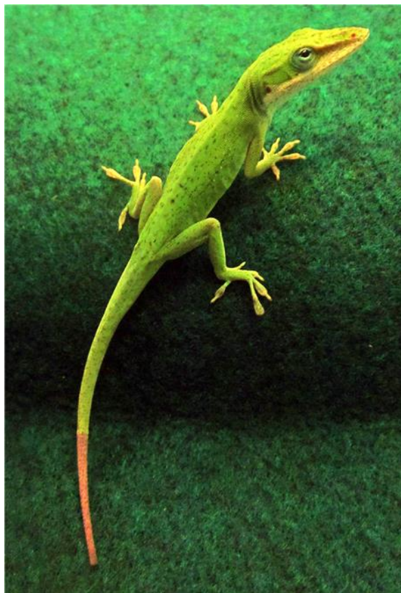
Figure 1: Male Anolis carolinensis specimen with a regenerated tail marked as brown color [13].