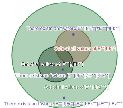
Figure 1. Below F_r^* , F_k^{**} , F_z^{***} are non-equivalent starred sequences of sets, where V' is all circles and E^{**} is the generalized expected value of f w.r.t either \star -sequence of sets (def. 8)

Definition 12 (Equivalent Starred-Sequences of Sets). All starred-sequences of sets (in the set of \star -sequences of sets) are equivalent, if we get for all f \in V' (def. 10); the generalized expected value of f (def. 9) w.r.t each starred-sequence of sets has the same value.