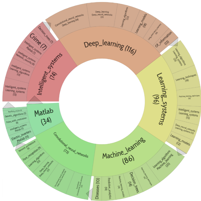
Figure 2. Circles diagram displaying the clustering of conference proceedings by Indian researchers using the Lingo3 algorithm.

The list below shows the titles of the Indian papers belonging to the Deep Learning cluster: