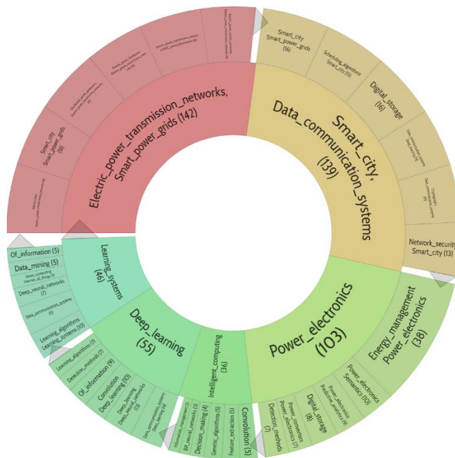
Figure 3. Circles diagram showing the clustering of conference proceedings by researchers from China using the Lingo3 algorithm.

In the Chinese conference proceedings, the main cluster of documents is described in two terms and is more specific than in the case of the Indian publications, it is described as: Power Transmission Networks AND Smart Power System. This topic is directly related to the energy sector, so the Chinese papers on the topic under consideration will be of higher interest.