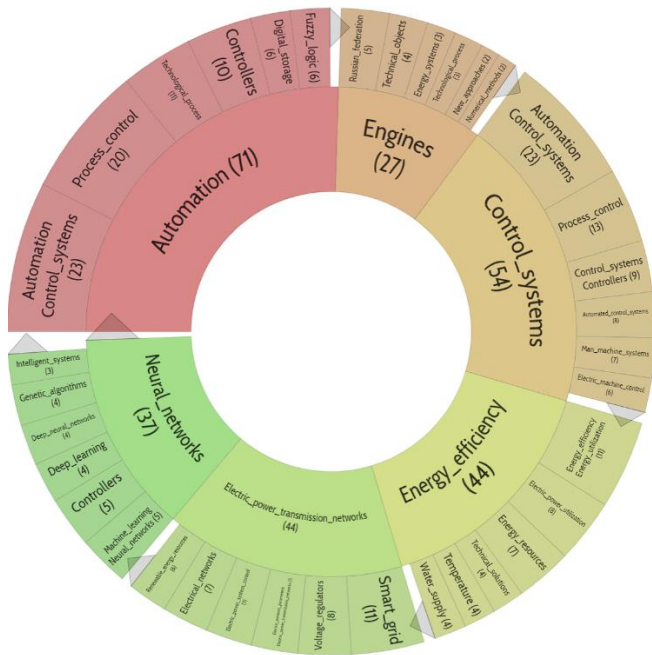
Fig. 1. Circles diagram representing the clustering of Russian conference proceedings by the Lingo3 algorithm.

Automation, Control systems, Energy efficiency, Engines, Electric power transmission networks and Neural networks – are the labels of the first level clusters.