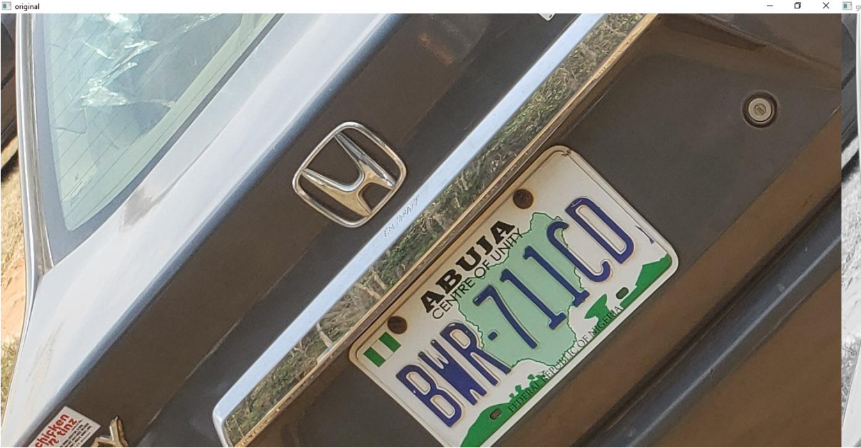
Figure 3. Original colored car image(author, 2023).

HSV, etc. up to greyscale. It varies between all-black and all-white (geeksforgeeks, 2023). The importance of grayscale images of a vehicle is that we can work with a single-channel image as supported by OpenCV.