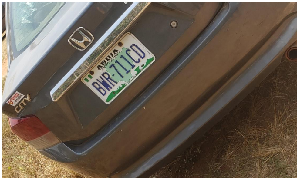
Figure 8. Undetected license (author, 2023).