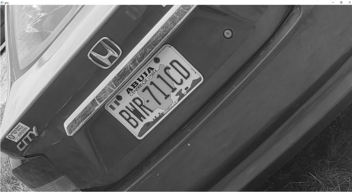
Figure 4. Gray image (author, 2023).