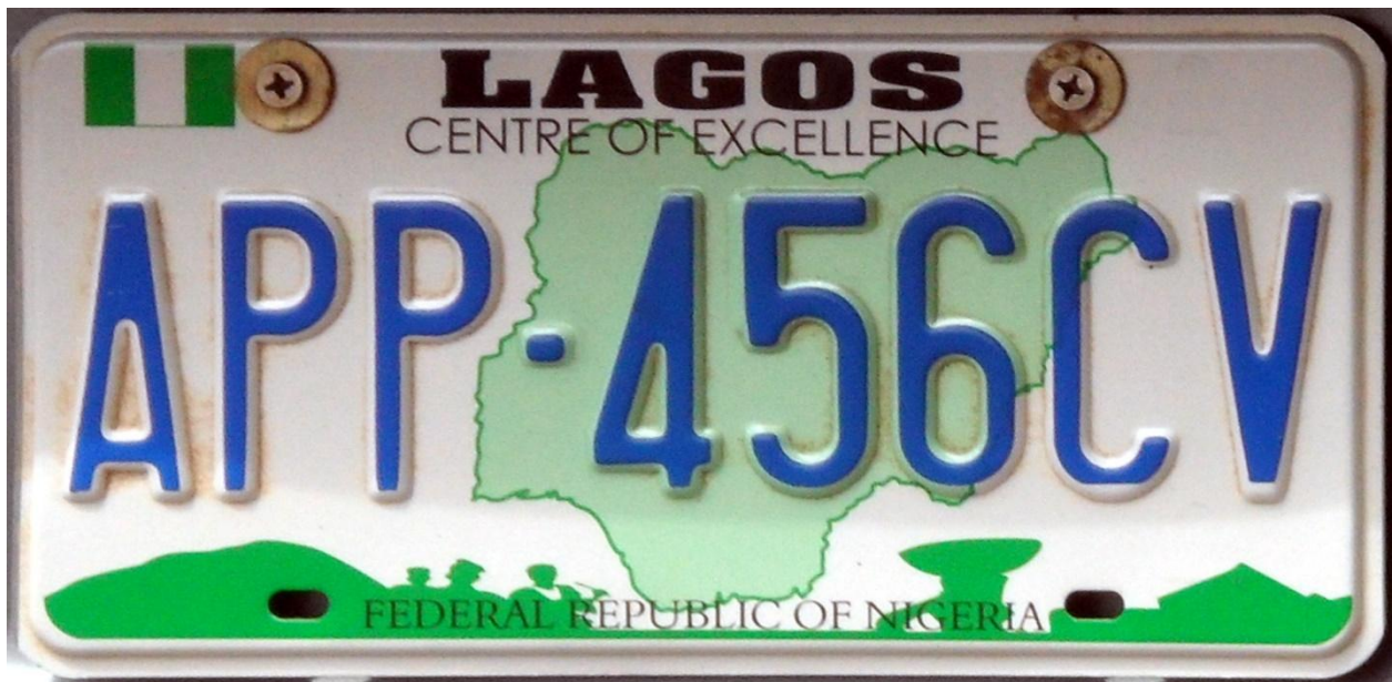
Figure 2. Nigeria plate number.