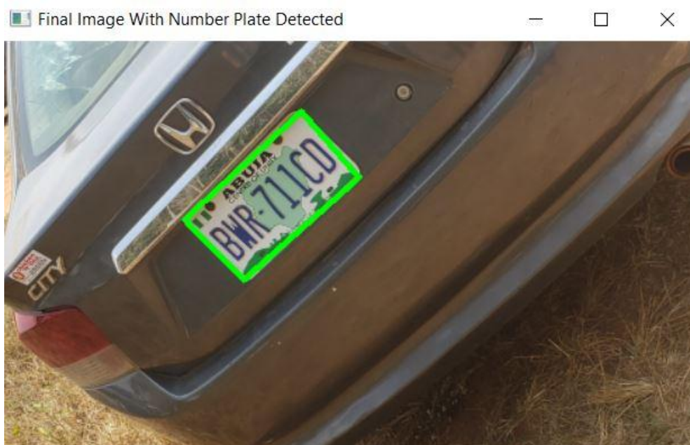
Figure 7. License plate number detected.

The edges of the image are detected with cv2 canny edge (see fig. 5) and it's from this edge detection we find all of the contours present in the image the top 30 contours are sorted, and the contour selections are at random and only the top ones are selected; with a for statement, we set the perimeter of each of the contours and we select only the ones with four(4) corners. Pytesseract is then used to extract information from the recognized plate number.