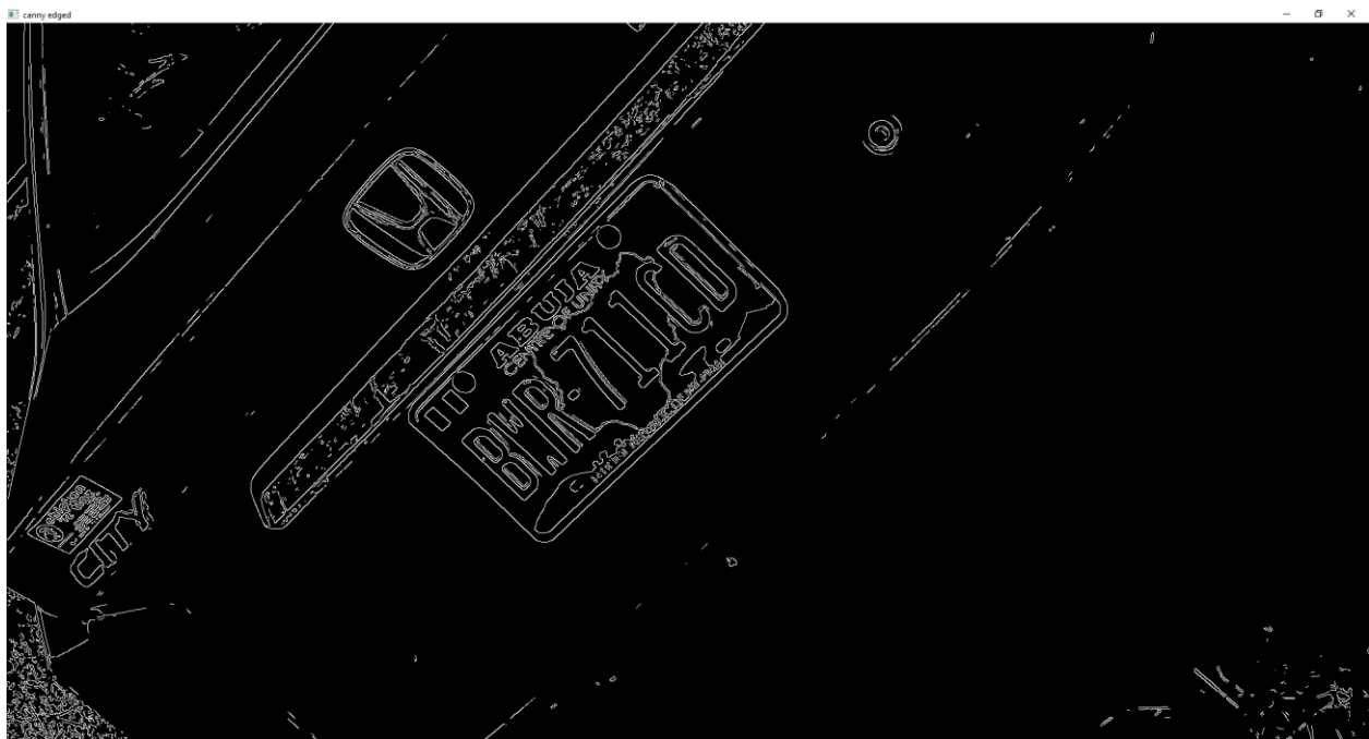
Figure 6. Canny-edged detection(author,2023).