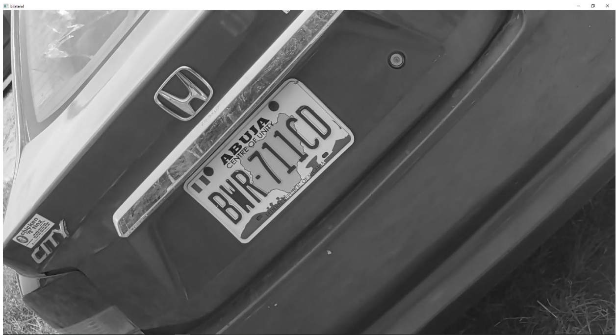
Figure 5. Bilateral filtered image(author, 2023).