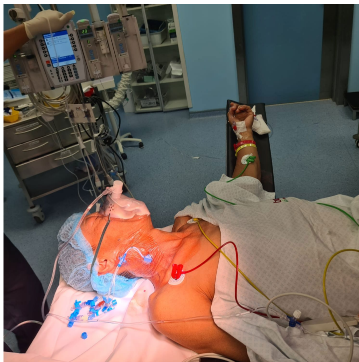
Figure 1. Patient after placement of thoracic epidural catheter receiving supplemental oxygen via a face mask, with a central venous catheter placed in the right internal jugular vein and an arterial line in the left radial artery for continuous hemodynamic monitoring.