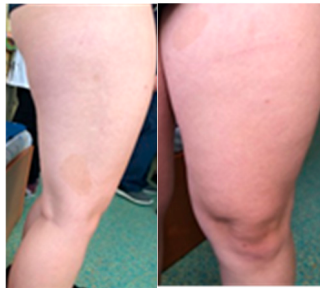
Figure 4. Café au lait spots on the lower limbs.