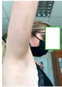
Figure 3. Axillary freckles.