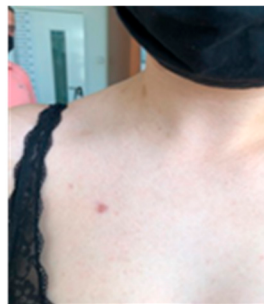
Figure 1. Cutaneous neurofibroma.

Phenotypical traits at the age of 17: normal stature (166 cm) and weight (66 kg). The patient presents with multiple café au lait spots (more than 10) disseminated over the anterior and posterior thorax, neck, abdomen, upper and lower limbs, thoracic neurofibromas, and axillary freckles (Figures 1–4).