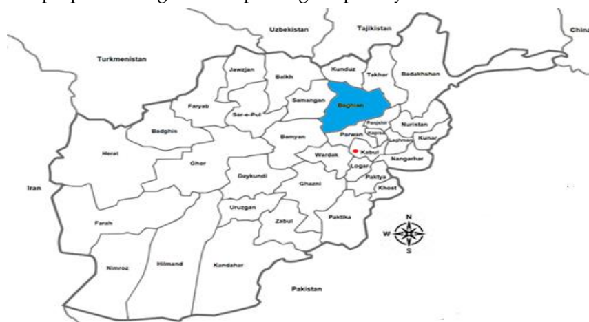
Figure 1. Map of Afghanistan and the study area.

Baghlan province, spanning 21,112 km 2 and home to approximately 1,053,200 inhabitants (Province Profile of Baghlan, 2019), is strategically located in northeastern Afghanistan. Situated at an average elevation of 550 meters above sea level, along the Kabul-Mazar-i-Sharif highway. The province's fertile valleys, abundant water resources, and diverse mineral deposits have positioned it as a significant agricultural and industrial hub in the country (Baghlan Province Profile, 2019). This study aims to investigate the factors influencing production efficiency in broiler farms within Baghlan province and to propose strategies for improving the poultry sector.