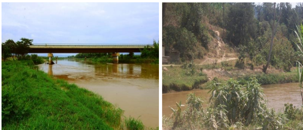
Figure 2. Sampling points on Nyabarongo river (a) Ruliba station (near Ruliba Clays Limited); (b) at Kirinda bridge.

Water was selected to determine the concentration of heavy metals being released into the rivers and the deterioration of water quality due to anthropogenic activities whereas fish was chosen because it constitutes the diet of many communities both in rural and urban areas. All samples were obtained in triplicate between April 2019 and May 2019 (10:00 am to 11:00 am, Central African Time).