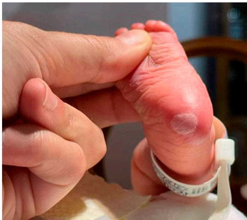
Figure 1. a-b) Single plantar erythematous bullous lesion present since birth.