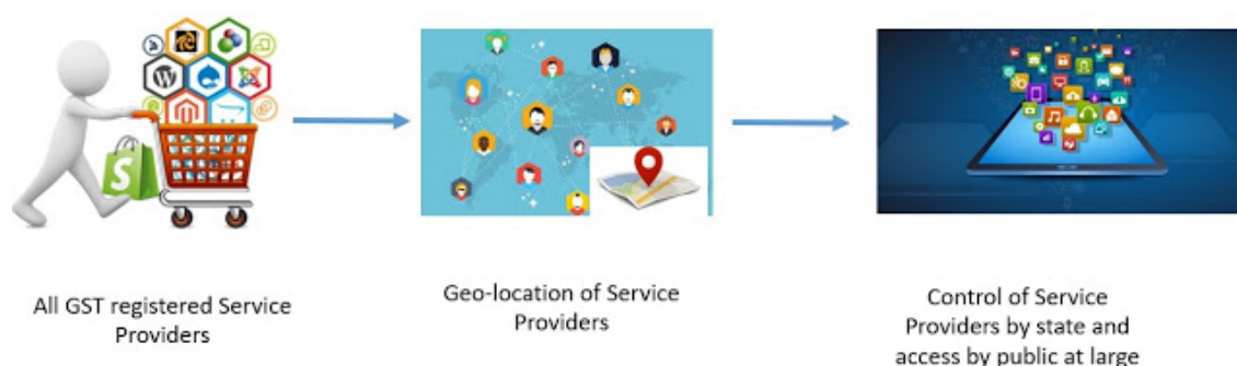
Fig. 2 A graphical representation of how the service providers can be geo-located and put in an App.

bringing transparency in the management of the pandemic. Additionally, the data and information will empower the government to have more control over the resources of the nation and will be better prepared to tackle the epidemic or pandemic situations.