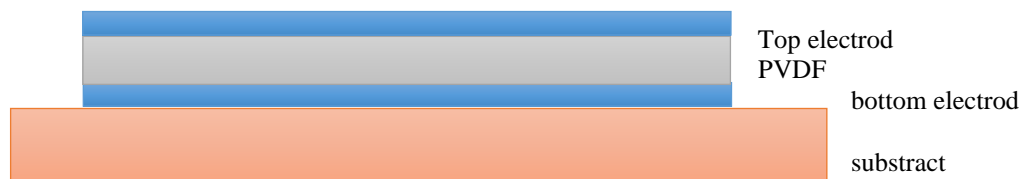
Fig.2. The smart structure stuck on woven fabric.

This section focuses on the effect of substrates parameters textiles in order to increase the power recovered by the PVDF polymer film. Optimization of these substrates is implemented in order to ensure good performance of this electroactive polymer for energy harvesting. The theoretical results are presented with an analysis of the 33-mode for the piezoelectric generator to verify the validity of the model developed for application in textile.