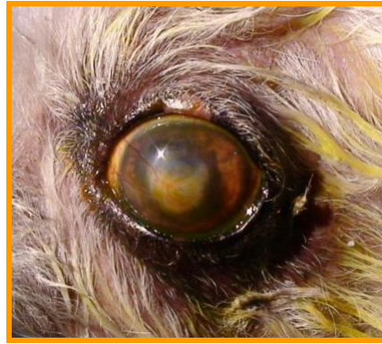
Figura 3. Fluorescein test stain showed absence no corneal injury after cATMSC therapy. Photograph of the left eye of a female Poodle dog after cATMSCs therapy submitted to fluorescein test with negative result.