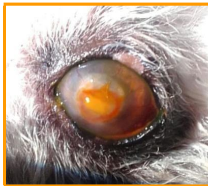
Figure 1. Fluorescein test stain showed corneal injury. Photograph of the left eye of a female Poodle dog with CU under fluorescein test with positive result.

The female Poodle dog with recurrent CU in the left eye was diagnosed with a positive fluorescein label (Figure 1). ST, OF and biomicroscopy were also performed for followup and differential diagnosis.