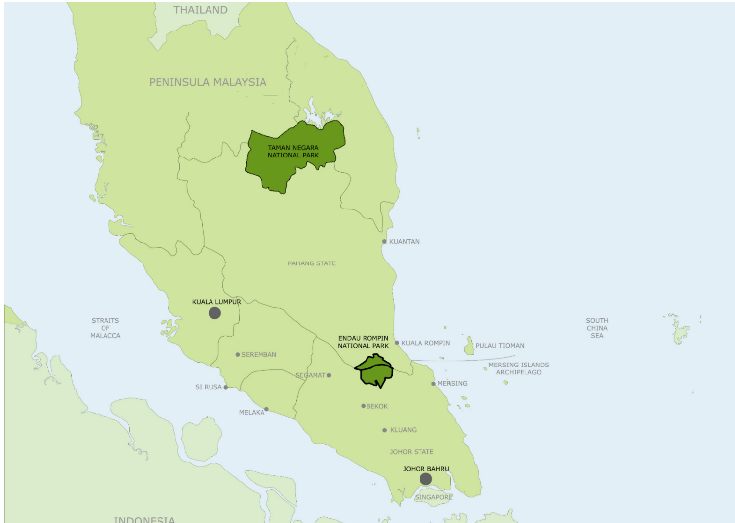
Figure 1. Endau Rompin National Park context, Peninsular Malaysia's second largest national park; the largest National Park - Taman Negara – is also shown