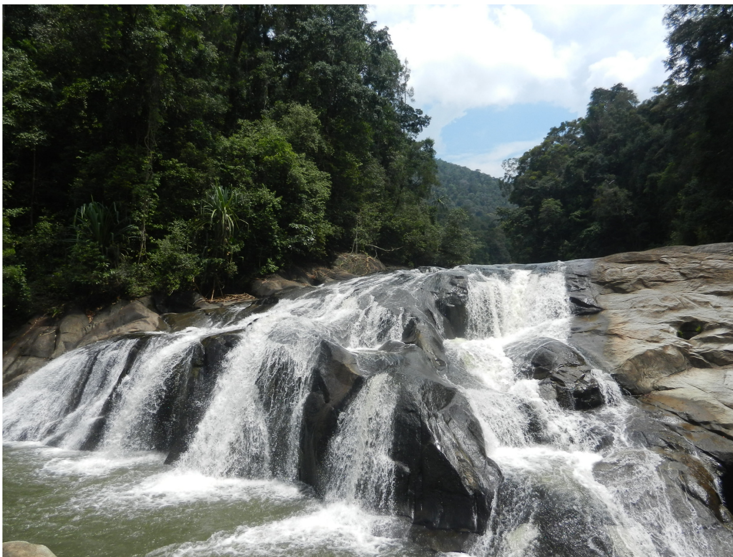
Figure 4. Spectacular Upeh Guling waterfalls, Endau Rompin National Park