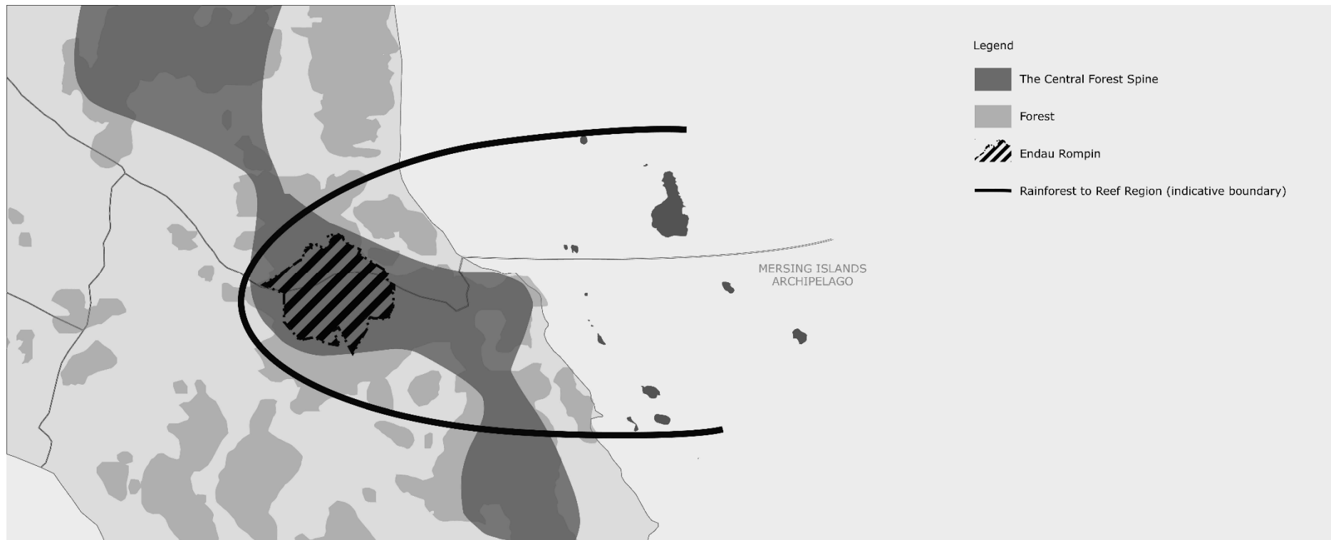
Figure 6. Malaysia's new ' Rainforest to Reef Region ' is envisaged as a wider strategic development zone based around ecotourism, stretching from the Park's Western boundary, across the coastal plain to the South China Sea, and then offshore to the Mersing Islands