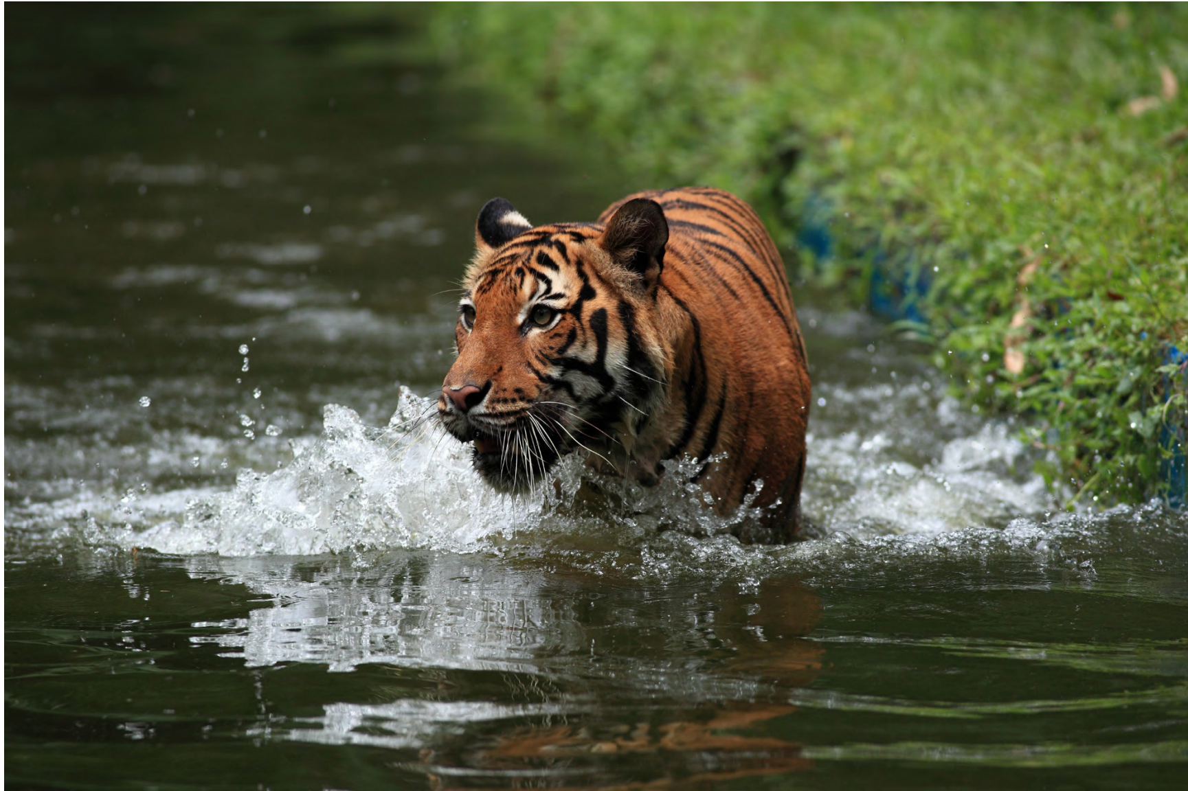
Figure 2. Malaysian Tiger; Endau Rompin's flagship species and Malaysia's national emblem