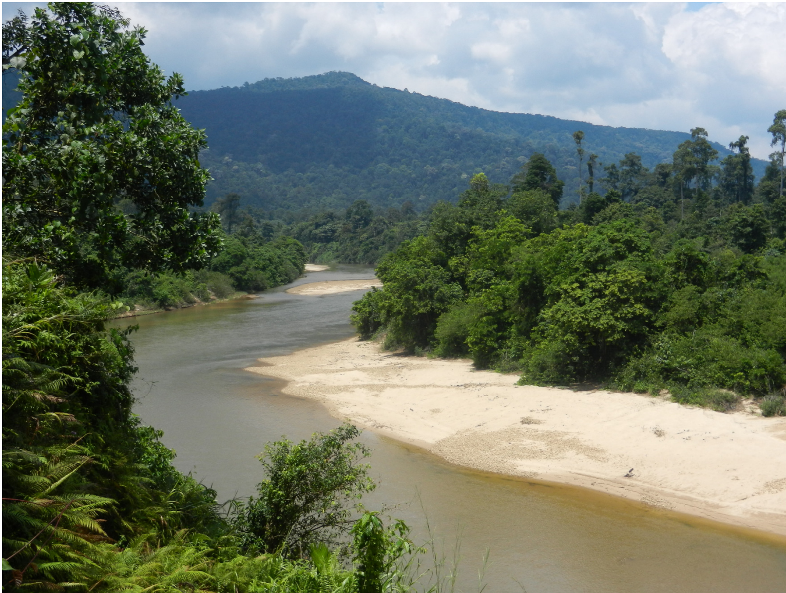
Figure 3. Sungai Endau near Kampung Peta on the eastern margin of Endau Rompin National Park