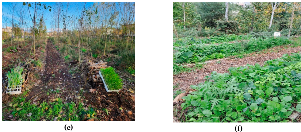
Figure 3. Chronosequence of the experimental site's spatial evolution (2019–2025). (a, b) Baseline stage (2019–2020): Initial conditions characterized by high soil compaction and ecosystem stress. (c, d) Implementation phase (2021–2023): Introduction of Successional Agroforestry (SAFS) layers and nursery management. (e, f) Mature establishment (2024–2025): evolution into a complex, multi-layered vertical structure. The system shows high biomass accumulation, with vegetation cover reaching 85% and the differentiation of four distinct stratified layers (herbaceous, shrub, sub-canopy, and canopy).