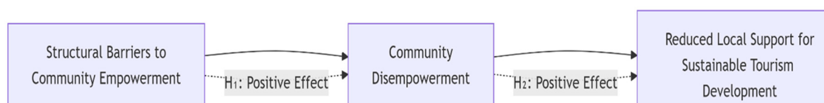
Figure 1. Conceptual framework.

Hypothesis 2. Community disempowerment has a positive effect on reduced local support for sustainable tourism.