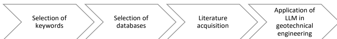
Figure 3. Schematic representation of the research.

This study provides a comprehensive overview of the application of LLMs in geotechnical engineering. This research was initiated by selecting different pairs of keywords, including geotechnical engineering and large language model, geomechanics and large language model, large language model and slope stability, and large language model and bearing capacity analysis. Subsequently, various databases, including ScienceDirect, Google Scholar, the American Society of Civil Engineers database, and other sources, were selected and used to acquire literature. From various databases, approximately 30 research papers on the application of LLMs across different areas of geotechnical engineering were identified and summarized. Figure 3 shows the adopted methodology used in this research.