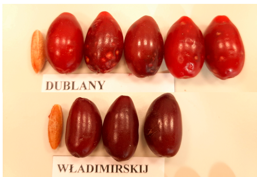
Figure 3. Fruits and stones of cornelian cherry cultivars.

Most cultivars have been selected for their external appearance, so they have fruits larger than those found in nature and are often characterised by a small share of the seed in the entire fruit mass (Table 1). The lowest proportion of seeds (9–10%) was recorded in the fruits of Ukrainian cultivars, such as: ‘Ekzotychnyj’, ‘Grenadier’, ‘Yeljena’, ‘Yevgeniya’ ‘Mriya Shaydarovoi’, ‘Naspodevanyj’, ‘Nikolka’, ‘Oryginalnyj’, ‘Pervenets’, ‘Priorskij’ and ‘Svetlyakov’. On the other hand, the highest values of the aforementioned trait (over 14%) were characterized by Polish cultivars such as: ‘Bolestrashytskii’, ‘Kresoviak’ and ‘Pachoskii. Assuming that the average weight of cornelian cherry is 3.5 g, 100 kg of fruit of cultivars, where the stone share is 9.5% (the first column of Table 1), is equivalent to the seed yield of 9.4 kg. For cultivars with a higher proportion of seeds, the yield of seeds from 100 kg of fruit can be up to 14.5 kg.