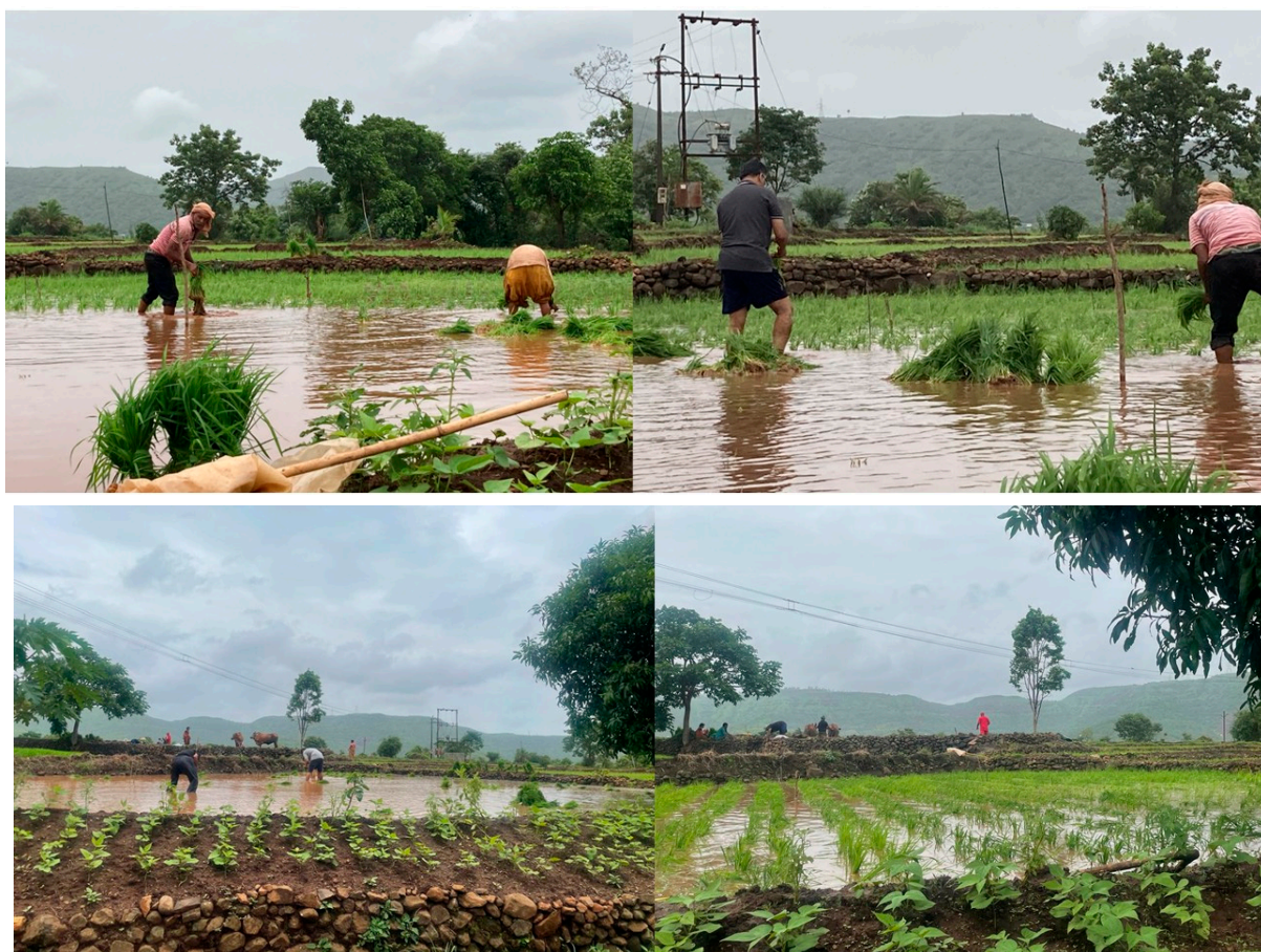
Figure 1. b: Transplantation of the treated plants in 4m x 3m plots in a flooded rice field in a randomized design was done (July 3 2024).