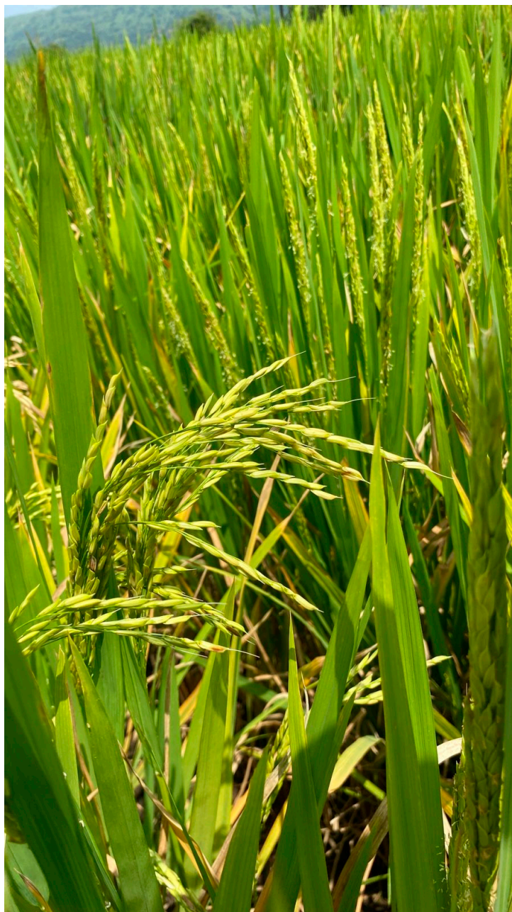
Figure 2. Early flowering and grain formation were observed in rice plants inoculated with Methylomonas Kb3. In the background, control plants can be seen (Observations taken on September 19, 2024, ~ 100 days after sowing).