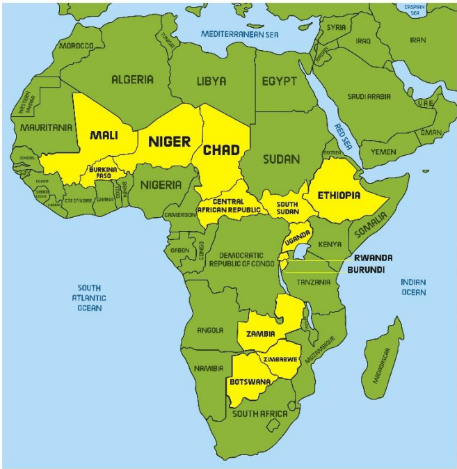
Figure 1: Landlocked countries in African continent.

integration, logistics infrastructure, local agents’ logistics capability, and national law and policy ( Yang and Chang, 2019 ).