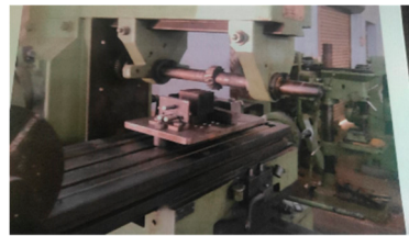
Figure 4. Fixture System in Milling Machine.