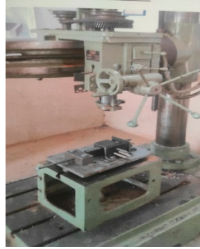
Figure 3. Fixture System in Drilling Machine.