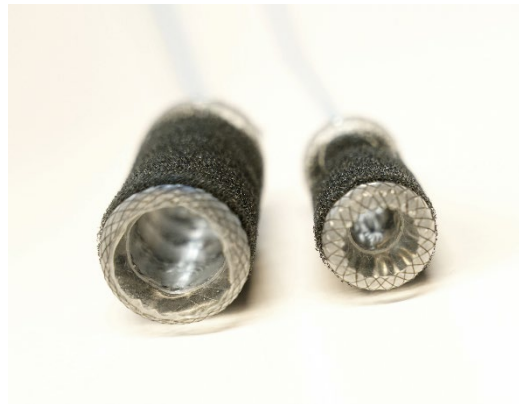
Figure 1. VacStent GI™: left side VACStent Colon (inner diameter 25 mm), right side VACStent Esophagus (inner diameter 12 mm).

To provide an initial overview of VacStent GI™ research results to date, this review summarises the results from four prospective studies using VacStent GI™ for upper gastrointestinal leaks. Studies comparing the use of conventional SEMS and EVT with an endosponge for treating gastrointestinal leaks are summarised in a review by Schäfer which we used as a benchmark [4].