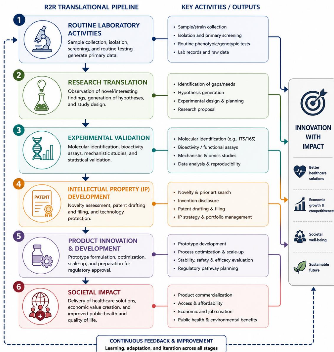
Figure 1. Conceptual schematic of the Routine-to-Research-to-Innovation (R2R) framework, illustrating the end to end translational pipeline from routine laboratory experimentation through research validation and intellectual property (IP) development to product innovation and societal impact.