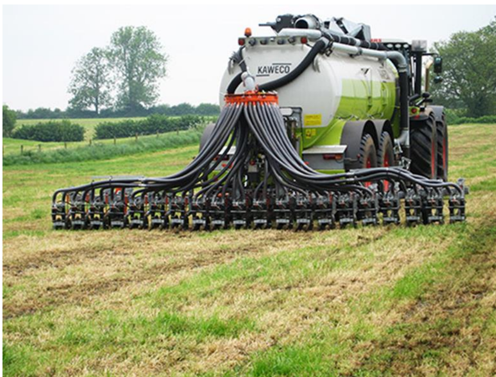
Figure 1. The application of this nutrient-rich biofertilizer is a key component of nutrient cycling in a circular bioeconomy but requires careful management to align with crop needs and prevent environmental losses.

However, the global policy landscape has shifted dramatically. The urgent need to mitigate climate change and transition from fossil fuels has propelled a massive expansion of renewable energy technologies. Driven by ambitious policies such as the EU Renewable Energy Directive, anaerobic digestion has been widely adopted as a parallel strategy for organic waste management. The primary allure of AD is its capacity to produce bioenergy in the form of biogas, which can be used to generate electricity and heat or upgraded to biomethane for injection into the natural gas grid (Weiland 2010). While the primary output of AD is energy, the process also generates a voluminous co-product: a nutrient-rich slurry known as digestate. The scale of this co-product is immense; in Europe alone, an estimated 31 million tonnes of dry matter digestate were produced in 2022, a figure projected to rise to 177 million tonnes by 2050 (European Biogas Association, 2024).