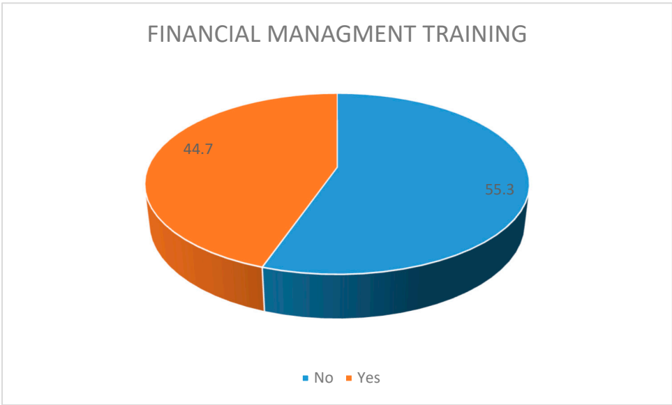
Figure 2. Owner manager financial training.

The figure below shows that out of the 295 MSMEs that took part in the research, 72.2 percent (213) mentioned that they had encountered a number of problems when applying financial management strategies, and the remaining 27.8 percent said they had no problems at all.