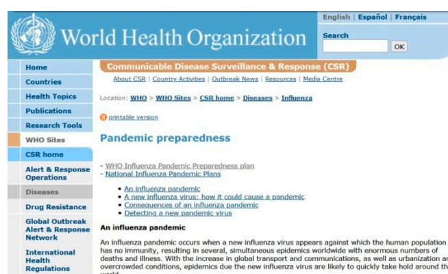
Figure 4. Communicable Disease Surveillance & Response Geneva, WHO, February 2, 2003; 14:05:45.[26]

The first description of a pandemic, available on the WHO website, dates back to February 2, 2003. In particular, it says: "An influenza pandemic occurs when a new influenza virus appears against which the human population has no immunity, resulting in several, simultaneous epidemics worldwide with enormous numbers of deaths and illness ." Further: "With the increase in global transport and communications, as well as urbanization and overcrowded conditions, epidemics due the new influenza virus are likely to quickly take hold around the world".[26] This description was similar to that which appeared in the WHO document published in 2005.[19]