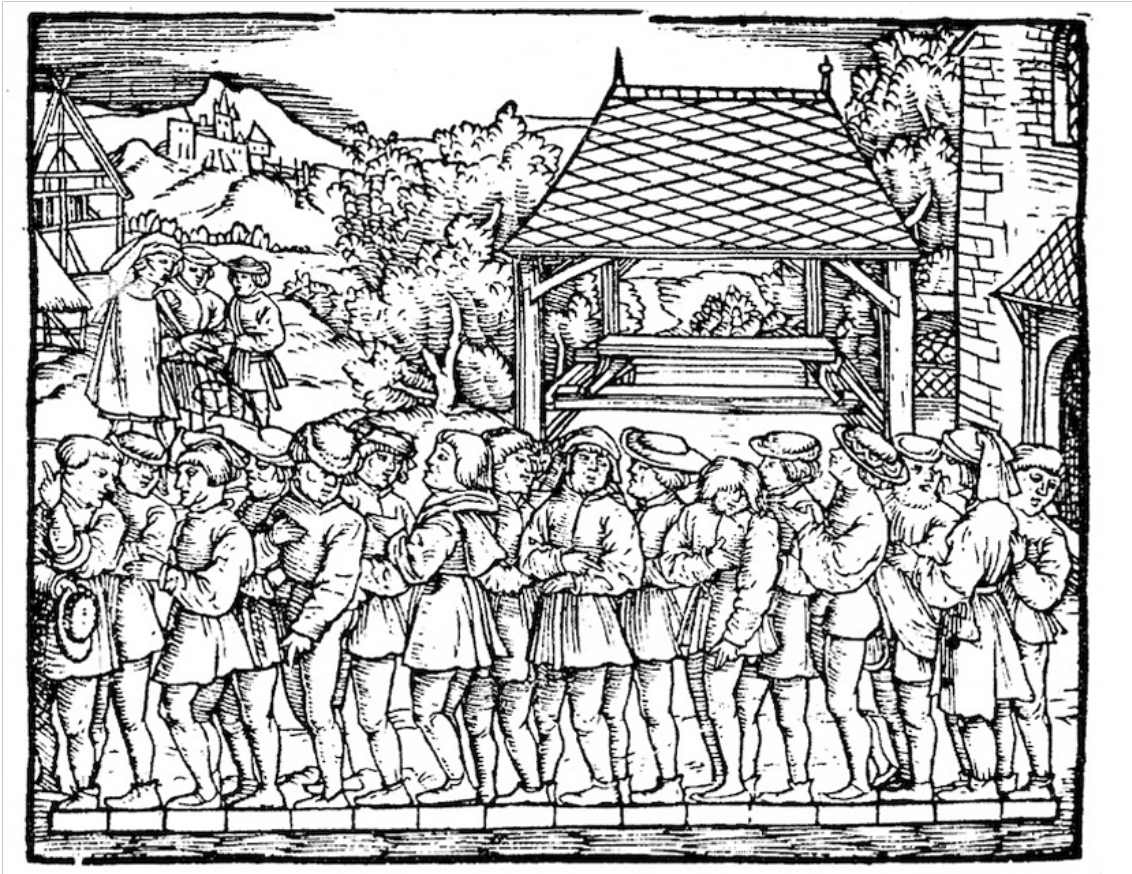
Figure 2. Estimation of foot length.