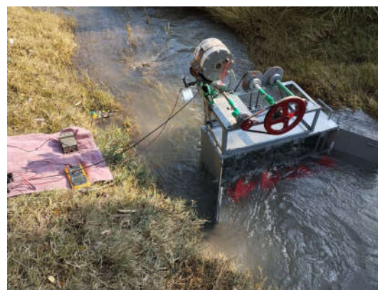
Figure 1. Micro hydroelectric power station based on a water engine.

The engine works as follows. The engine is immersed in water with the front side perpendicular to the water flow and the frame legs are fixed to the bottom. A chain transmission is installed on the rear side of the engine. The working blades will be perpendicular, and the working shafts parallel to the direction of the flow. The generator and power take-off shaft platform located on the frame is above the water. The water flow affects the working blades. Since the blades are located across the plane of the shaft at a certain angle (30 ... 60°), they rotate due to the flow of water. Due to the rigid fixation of the blades, the shaft itself rotates. The rotation of the shaft is transmitted to the power take-off shaft by means of chain transmissions.