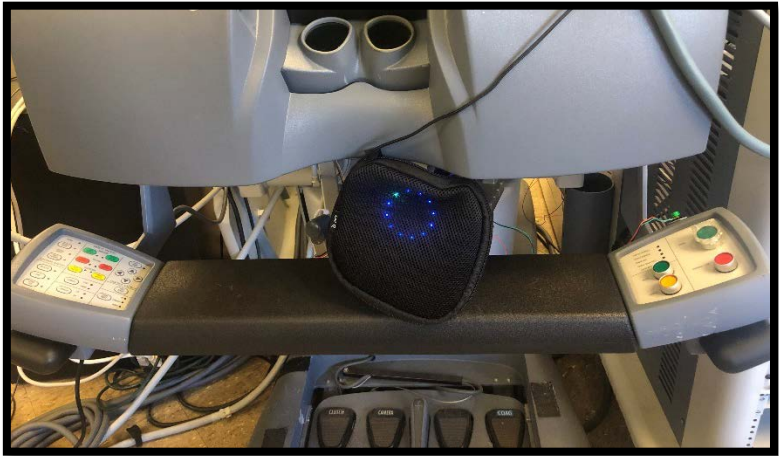
Figure 1. The daVinci Standard outfitted with a microphone. We have also modified the system to add a head sensor and buttons on the hand controllers to activate camera and tool clutching. These buttons could also be used for voice activation.

As illustrated in Figure 2, our system gets input from a microphone near the operator, preprocesses the message and sends it to the Chat-GPT language model, the model is trained (by giving it a few examples in the prompt) to respond specifically to give only the possible commands and the output is checked to ensure this. The responses are then translated to command the hardware. The system provides a beep or buzz as feedback to the surgeon indicating success or failure. Although our current feedback to the surgeon is only via sound and voice, we envision that Augmented Reality techniques could also be used as feedback for the surgeon.