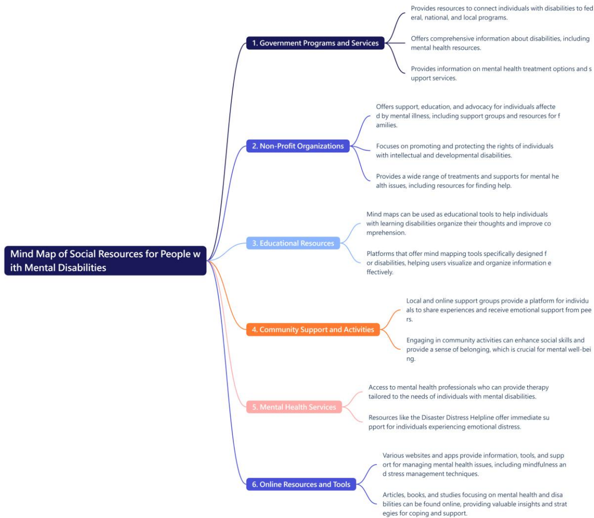
Figure 1. A Mind Map of Social Resources for People with Mental Disabilities.

further enhanced the functions of mind map, and has been applied to help patients with schizophrenia to organize and process information more effectively (Figure 1).