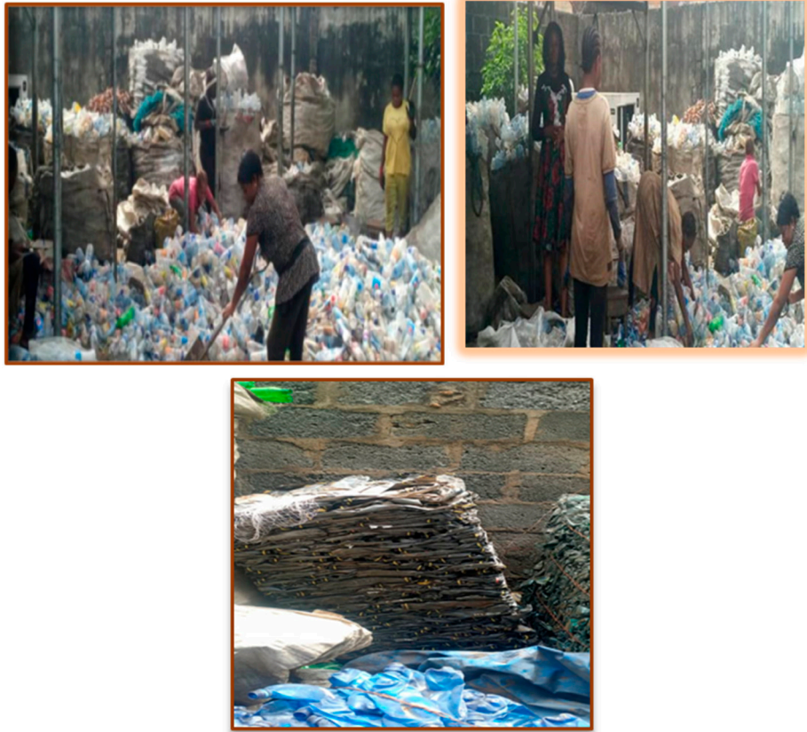
Figure 3a displays the gathering of plastic bottles, Figure 3b demonstrates the segregation process of plastic bottles, and Figure 4a showcases the compacting of plastic bottles into bales before crushing.