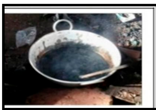
Figure. Melted Plastic And Nylon

To calculate the compressive strength of melted plastic and nylon specimen bricks after 7, 14, and 29 days of curing, the following formula can be used: \text{Compressive Strength} = \frac{\text{Maximum Load (in Newtons)}}{\text{Cross-Sectional Area of the Specimen (in square meters)}} The compressive strength of the specimen brick is typically calculated by dividing the maximum load the brick can bear by the cross-sectional area of the brick. This calculation is essential for determining the structural integrity and load-bearing capacity of the bricks over time as they cure. By conducting compressive strength tests at different curing intervals (7, 14, and 29 days), you can assess how the strength of the melted plastic and nylon bricks evolves over time and determine their suitability for various construction applications. The results of these tests will provide valuable data on the durability and performance of the bricks, helping in making informed decisions regarding their use in construction projects.