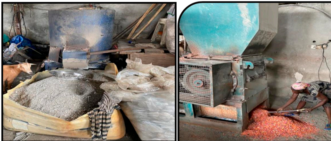
Figure 5. C , nylon waste is crushed, followed by the crushing of plastic waste in Figure 5D.