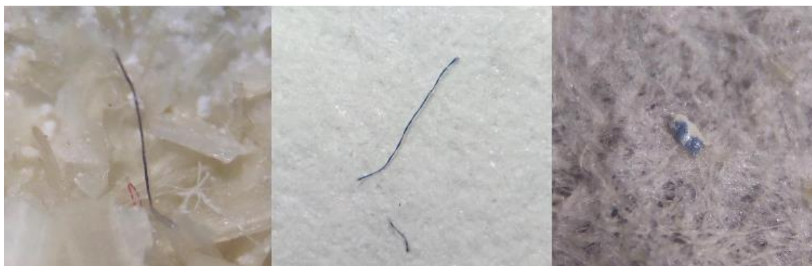
Figure 3. MP extracted from gills, colored fibers: blue and red, and white and blue film.

Regarding the classification by color and total abundance of MP, 704 blue, 200 black, 53 red, 9 green, 141 transparent, 17 yellow and 10 white were found. In intestines: 353 blue, 111 black, 28 red, 3 green, 51 transparent, 9 yellow and 6 white. In gills: 351 blue, 89 black, 25 red, 6 green, 90 transparent, 8 yellow and 4 white, as shown in table 3.