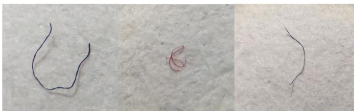
Figure 2. MP found in the digestive tract, blue and red fibers.