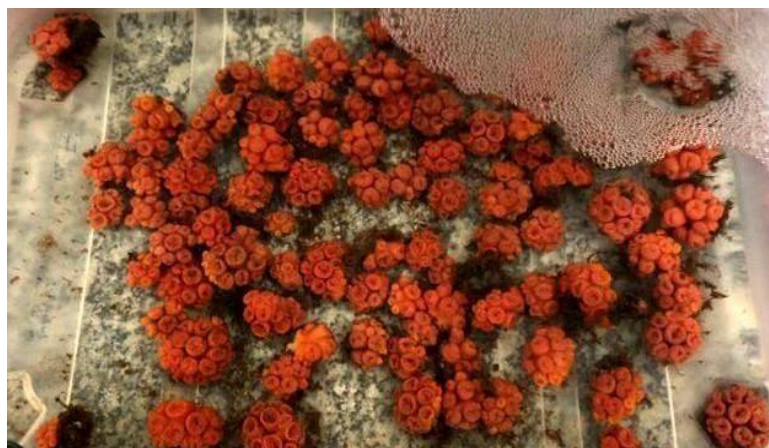
Figure 1. Colonies of Tubastraea coccinea during the acclimatization period in laboratory.

In the laboratory, the colonies were kept for five days in tanks with clean filtered sea water, under constant aeration, temperature of 23 \pm 2^\circ\text{C} , and natural photoperiod (12h:12h light/dark) for acclimation (Figure 1). Water was partially renewed daily using reconstituted seawater (RedSea®).